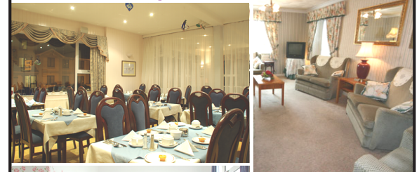
Hotel De La Mer