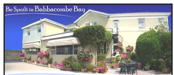
Be Spoilt in Babbacombe Bay