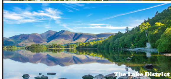
The Lake District