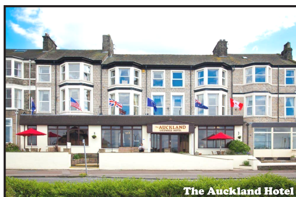
The Auckland Hotel