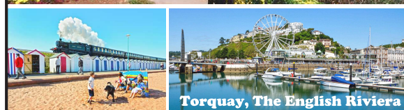
Torquay, The English Riviera