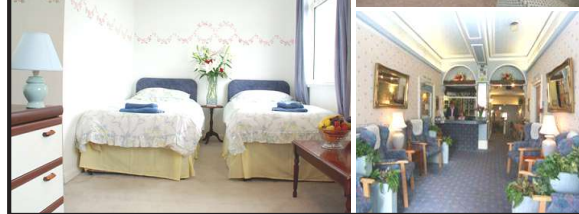
Hotel De La Mer