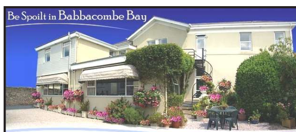
Be Spoilt in Babbacombe Bay