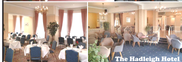
The Hadleigh Hotel